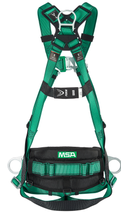
V-FORM, Steel Hardware, Back & Chest D-Ring, Shoulder Loop, Qwik-Fit buckles (P/N 10205379/10205380/10205381)