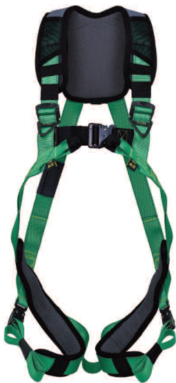
(1) Front view