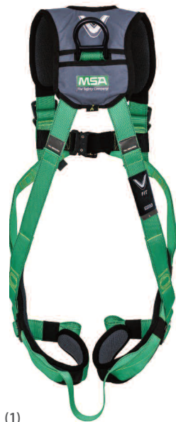
(1) Back view