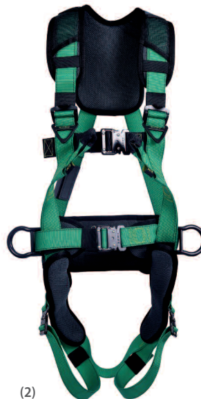
(2) Front view