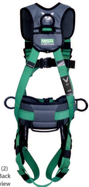
(2) Back view