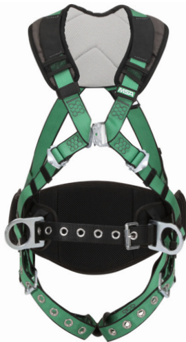
V-FORM+ Construction Harness