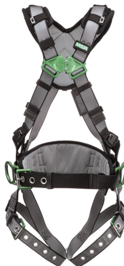
V-FIT Construction Harness