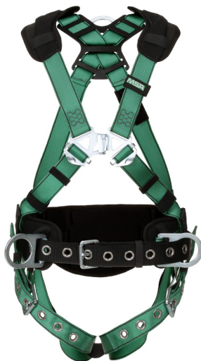
V-FORM Construction Harness