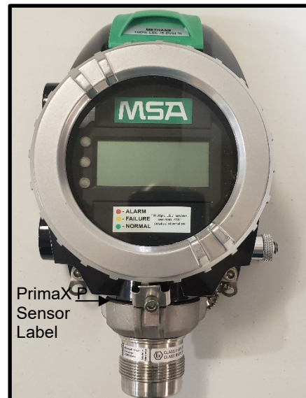
Figure 1 – Sensor Label Location