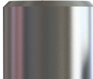
Figure 3 – Unflared Shaft End