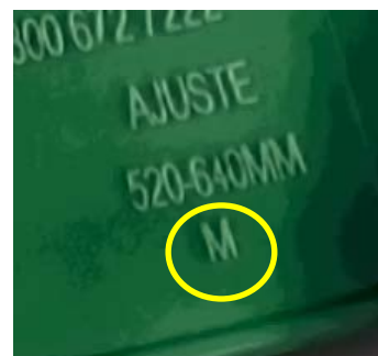
Figure 3 – Medium Size