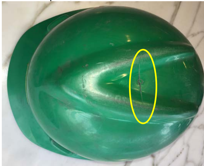
Figure 1 – Cracking in a Green Colored MSA V-Gard Protective Cap

MSA is issuing this Safety Advisory to inform you that MSA has received field reports that some green colored MSA V-Gard Protective Caps are cracking. The cracking occurs at the top of the cap, as shown in Figure 1, and is not caused by an impact to the cap. MSA has confirmed that the cause of the cracking is limited to green colored, medium size MSA V-Gard Protective Caps and that corrections have been made to prevent recurrence.