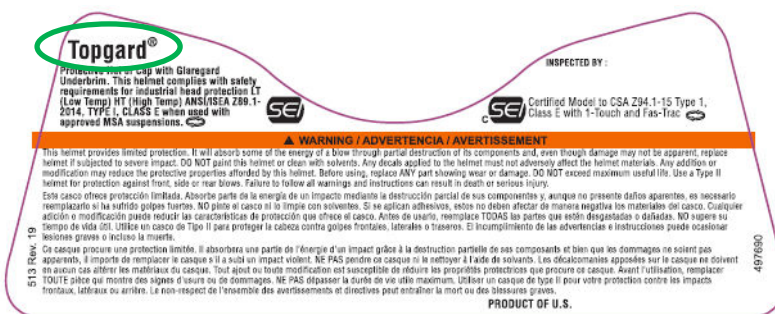
Topgard Helmet Label Located Inside Helmet Shell

To identify affected helmets, check that the helmet shell is white and a cap style, with a brim only in the front. Also check that the label inside the helmet shell confirms that it is a “Topgard” model, as shown below. Then, check the shell mold date emblem on the underside of the helmet brim, as indicated in the photo below. If the shell was molded in January 2017 or February 2017, the helmet is affected and should be removed from service and replaced. All other helmet models, colors, and shell mold dates are not affected.