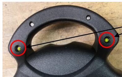
Yellow Tamper Evident Paint

Please note that the replacement SRLs may also have a “date made” from 01-2015 through 08-2015, but include yellow tamper evident paint on the exterior housing screw heads near the handle, as shown in the photo below. These SRLs are new units that were factory upgraded to include a new brake assembly and are acceptable for use.