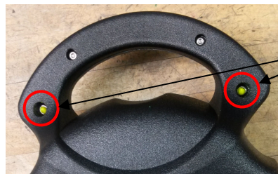
Yellow Tamper Evident Paint

Please note that the replacement SRLs may also have a “date made” from 01-2015 through 08-2015, but include yellow tamper evident paint on the exterior housing screw heads near the handle, as shown in the photo below. These SRLs are new units that were factory upgraded to include a new brake assembly and are acceptable for use.