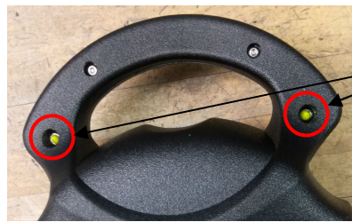
Yellow Tamper Evident Paint

Please note that the replacement SRLs may also have a "date made" from 01-2015 through 08-2015, but include yellow tamper evident paint on the exterior housing screw heads near the handle, as shown in the photo below. These SRLs are new units that were factory upgraded to include a new brake assembly and are acceptable for use.