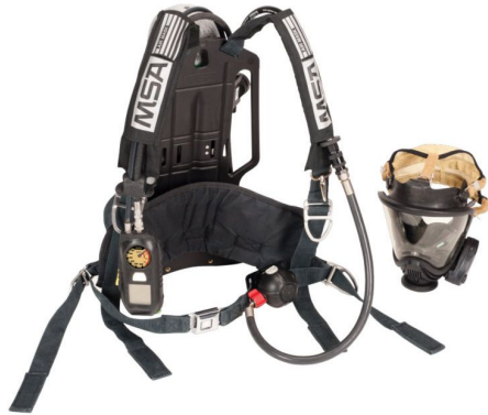
FireHawk M7XT Air Mask