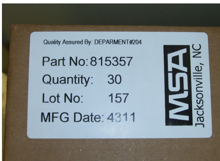
GMC Over-Pack Label