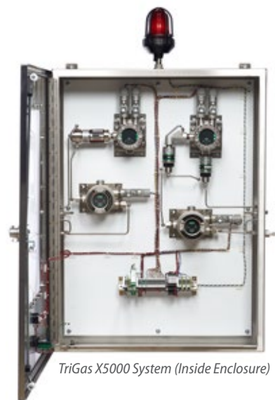
TriGas X5000 System (Inside Enclosure)