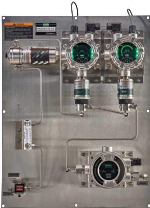
TriGas X5000 Flow Panel