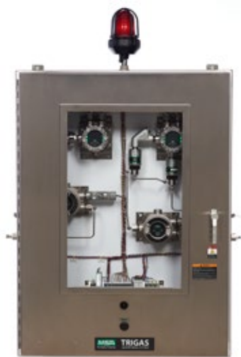
TriGas X5000 System