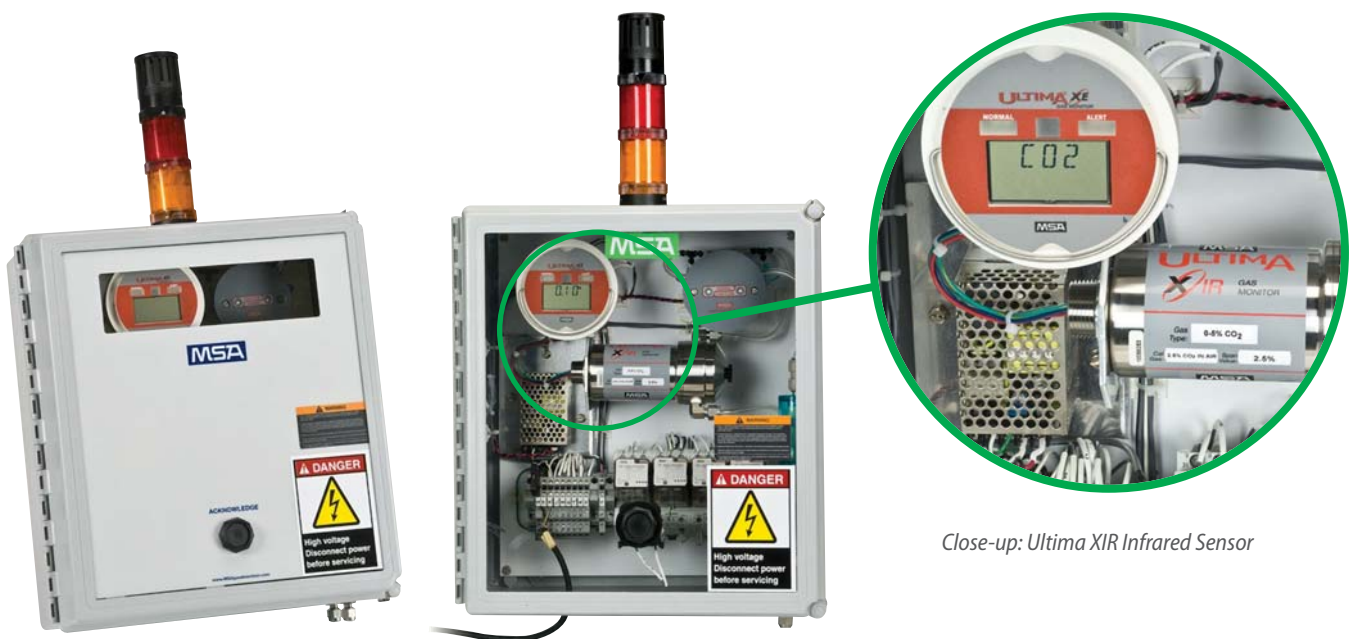
Close-up: Ultima XIR Infrared Sensor

MSA, working with the brewer, jointly developed the product and program that was introduced to all key instrumentation and electrical technicians as they upgraded each facility. MSA provided not only site start-up, but also site-specific operator training to transition to this new design as transparently as possible. With a nationwide network of field service personnel, MSA supports these systems in a timely manner, at reasonably low customer cost.