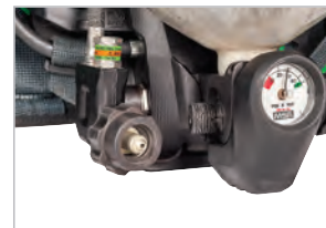
Threaded remote connection

1 Low profile version of the 45-minute, 4500 psig cylinder