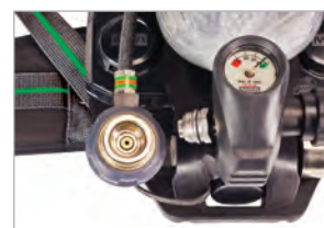
Quick-connect remote connection

2 Low profile version of the 45-minute, 4500 psig cylinder