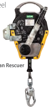
MSA Workman Rescuer

The winch with built-in energy absorber and a cable length of up to 30 m offers safe entry when no aids such as rungs or conductors are available. The integrated bracket can easily be mounted on the tripod. A double braking system provides secondary protection. In addition, loads of up to 140 kg for personnel and 225 kg for materials can be transported.