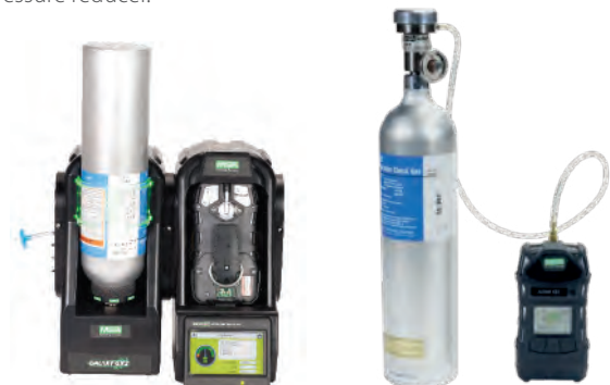
GALAXY GX2 Automated Test Stand

For your bump test and/or calibration needs, you can either opt for our GALAXY® GX2 Automated Test Stand or manual testing using a pressure reducer.