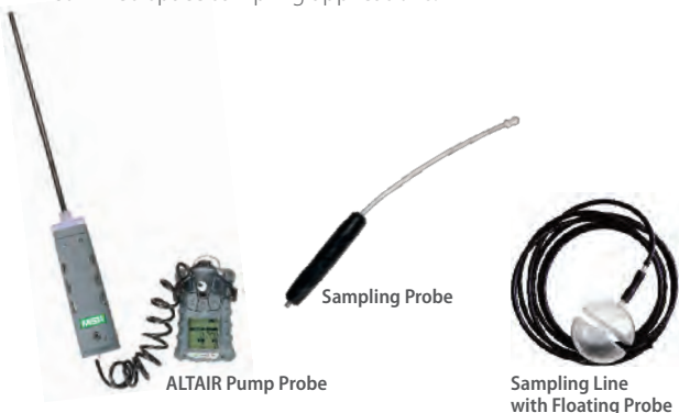
ALTAIR Pump Probe

The versatile ALTAIR® Pump Probe is a rugged sampling accessory, capable of drawing samples from up to 30 m away. It quickly converts ALTAIR 4XR into a pumped detector for remote confined space sampling applications.