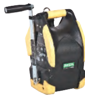
MSA Workman Winch

Weighing just 19.5 kg with a maximum extension length of 245 cm, this aluminium tripod is an ideal anchorage point for work assignments with limited staff. It is suitable for fall arrest, rescue, retrieval or evacuation and loads of up to 140 kg for personnel and 225 kg for materials. Installation is intuitive and fast taking 2 minutes only.