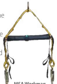
MSA Workman Spreader Bar

When connected to the shoulder loops of the MSA V-FORM harness, the MSA Workman spreader bar can be used for rescuing people from confined spaces. The attached web loops can be used to secure an incapacitated victim's arms when lifting or lowering. Certified according to EN 354.