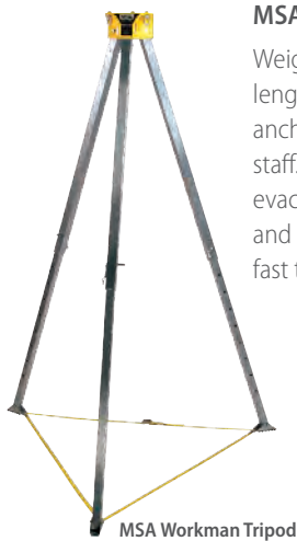
MSA Workman Tripod

For confined space entries without support points, MSA offers a unique system for personnel and cargo lowering into / rising from a confined space. The universal tripod provides a class B anchor point. Lifting is controlled by the MSA Workman Winch. Self-retractable lanyards serve as fall-arrest devices. The MSA Workman Rescuer provides fast, easy and intuitive fall protection with integral bidirectional retrieval capability.