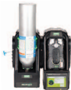
GALAXY GX2 Automated Test Stand

For your bump test and/or calibration needs, you can either opt for our GALAXY GX2 Automated Test Stand or manual testing using a pressure reducer.