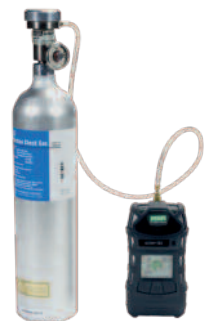
Manual Testing with Test Gas