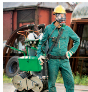
MASS Trolley & PremAire Combination