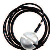
Sampling Line with Floating Probe