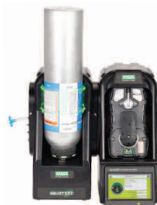
GALAXY GX2 Automated Test Stand

For your bump test and/or calibration needs, you can either opt for our GALAXY GX2 Automated Test Stand or manual testing using a pressure reducer.