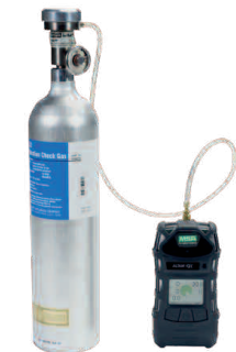
Manual Testing with Test Gas