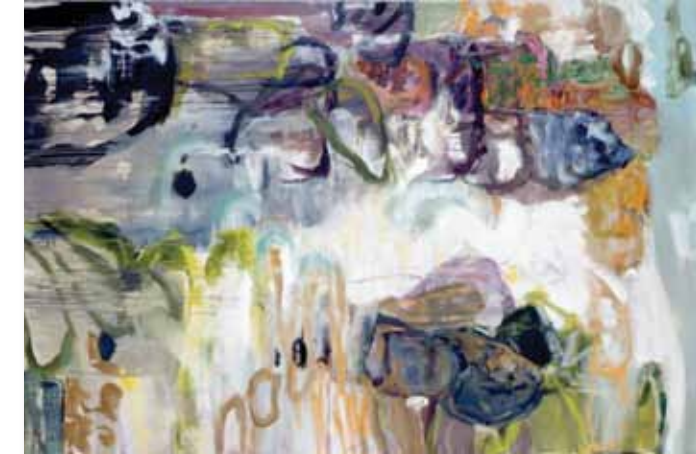
Michael Mazur Rocks and Water No. 6 Oil Painting on Canvas LOCATION: Hong Kong Boardroom