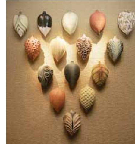
Alice Ballard Pod Diagonal Column Earthenware and Terra Sigillata Glazed Forms LOCATION: Asana