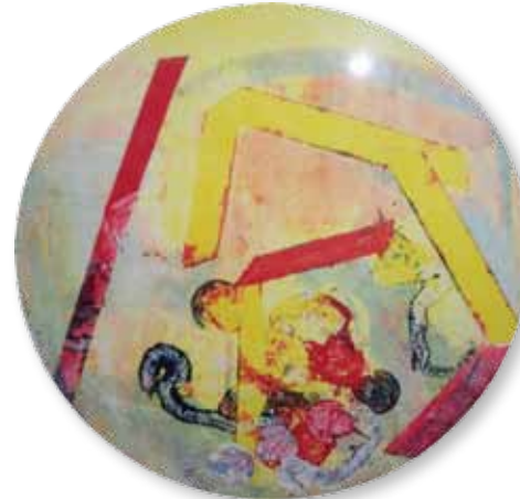
Judith A. Brust Beginnings No. 1 Original Painting on Panel LOCATION: Arcade Corridor