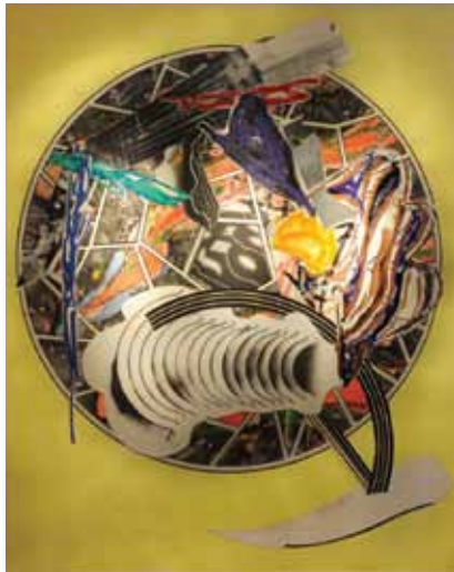
Frank Stella The Whale As A Dish Hand Colored Work LOCATION: Reception Main Lobby