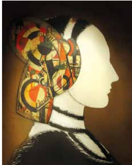
Manolo Valdes Valdes Perfill III Original Etching with Color Silkscreen LOCATION: Meeting Rooms & Circulation