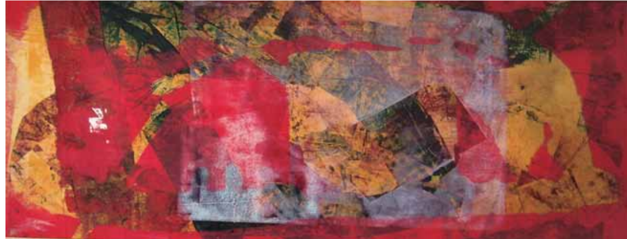
Judith A. Brust Big Red Original Layered Monotype Painting LOCATION: Oriental Gallery