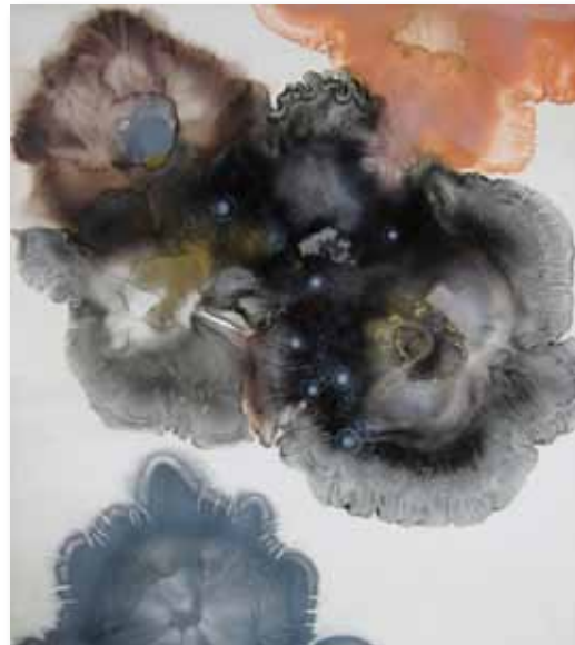
Terry Rose Oil, Micron Pigment on Aluminum Float Panel LOCATION: Lobby Corridor