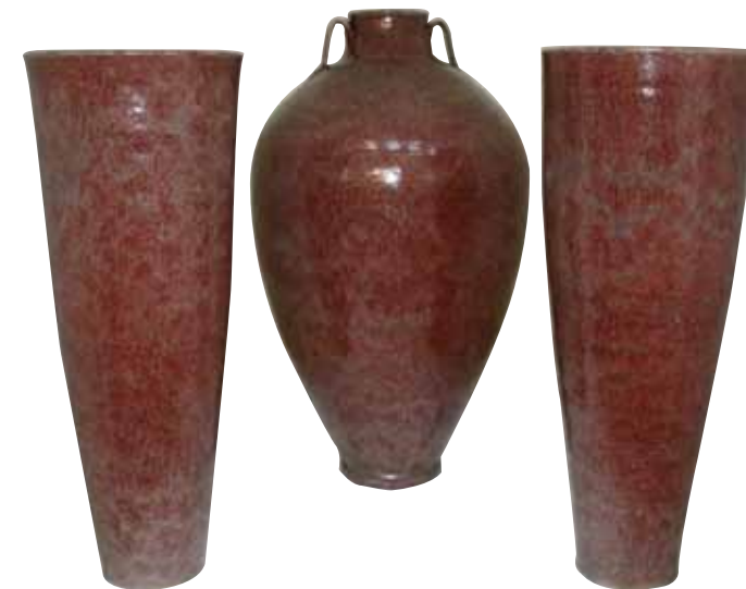
Ben Owen Tang Vase and Tapered Columns Custom Glazed Ceramic Pottery LOCATION: Lobby Lounge