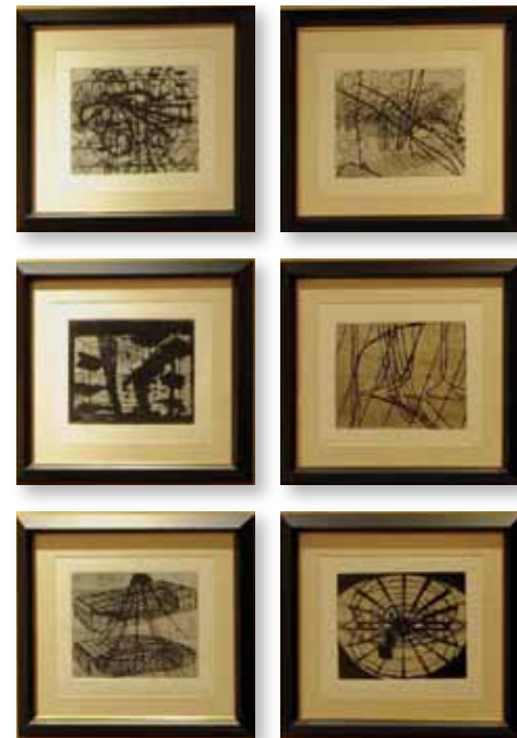
Terry Winters Shadowgraph Images, 2002 Wood Engravings LOCATION: Grand Staircase