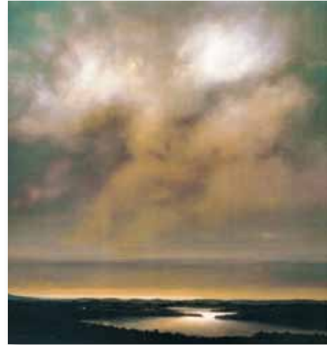
Tula Telfair Discourse of Pleasure, 2, 2002 Original Oil Painting on Canvas LOCATION: Oriental Gallery