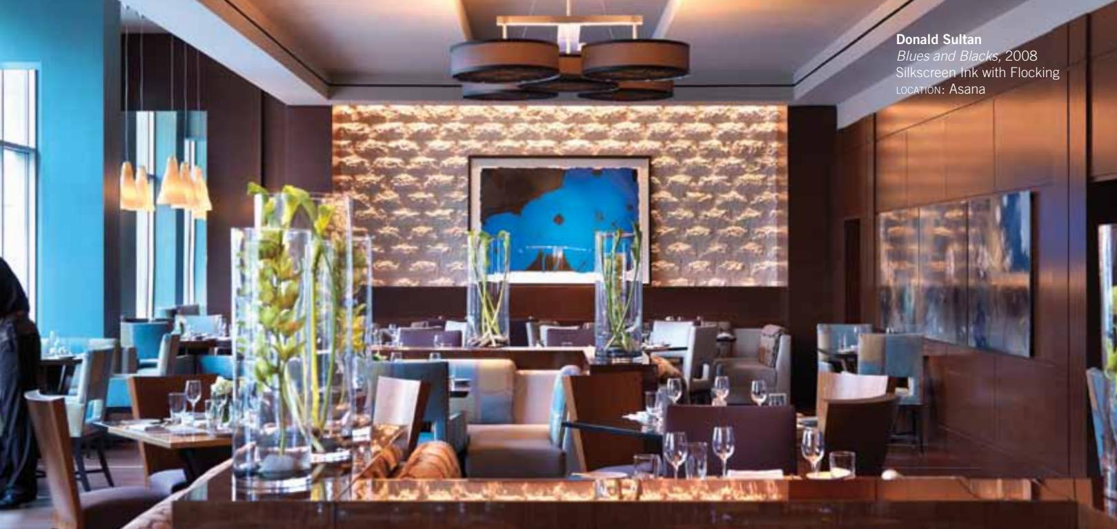
Donald Sultan Blues and Blacks , 2008 Silkscreen Ink with Flocking LOCATION: Asana