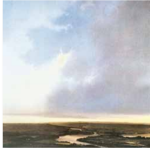
Tula Telfair Early Utopian Ideals, 2003 Original Oil Painting on Canvas LOCATION: Oriental Ballroom