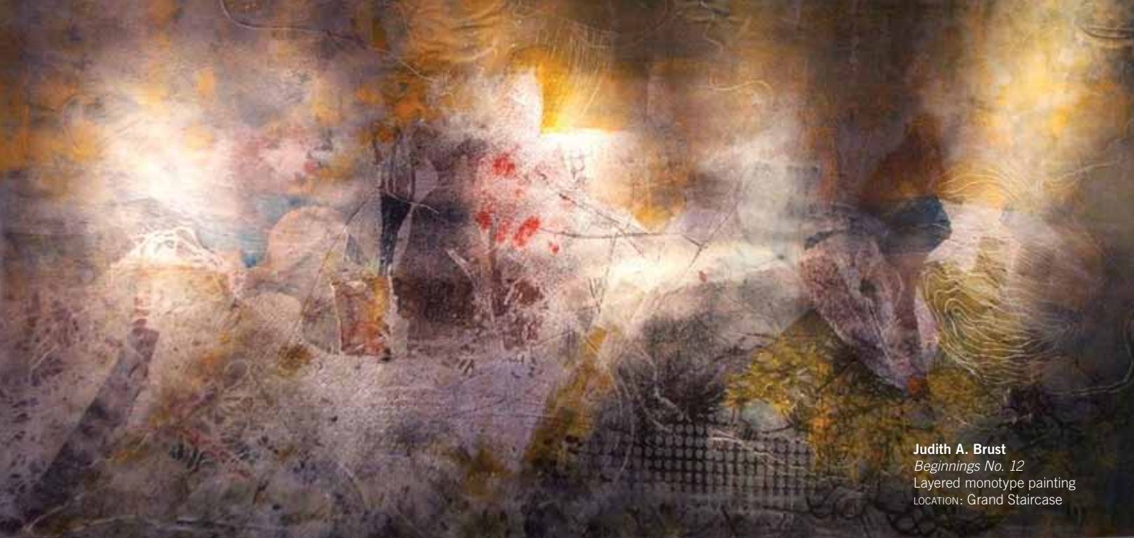
Judith A. Brust Beginnings No. 12 Layered monotype painting LOCATION: Grand Staircase