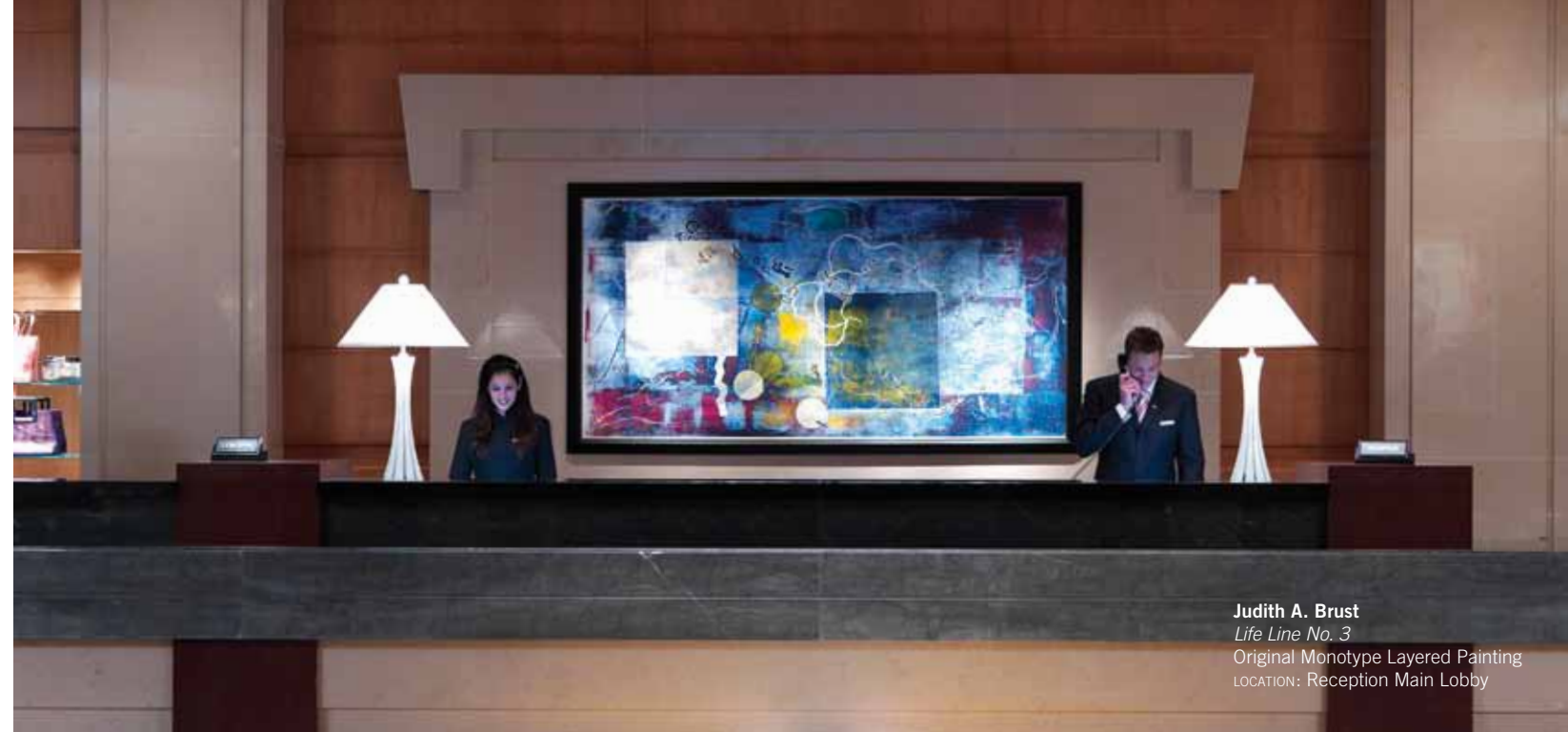
Judith A. Brust Life Line No. 3 Original Monotype Layered Painting LOCATION: Reception Main Lobby