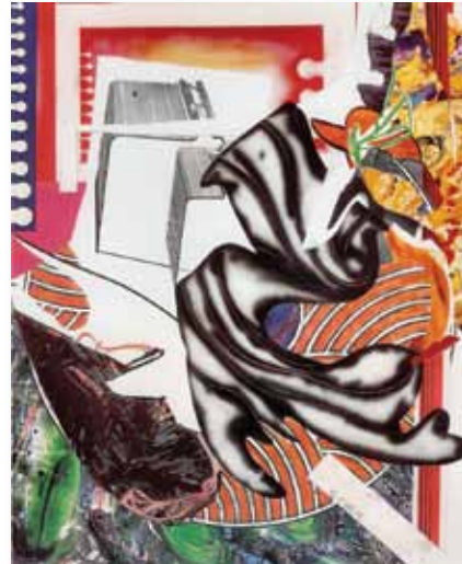
Frank Stella Moby Dick Hand Colored Work LOCATION: Reception Main Lobby