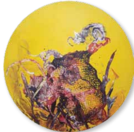
Judith A. Brust Reef No. 1 Original Painting on Panel LOCATION: Reception Main Lobby