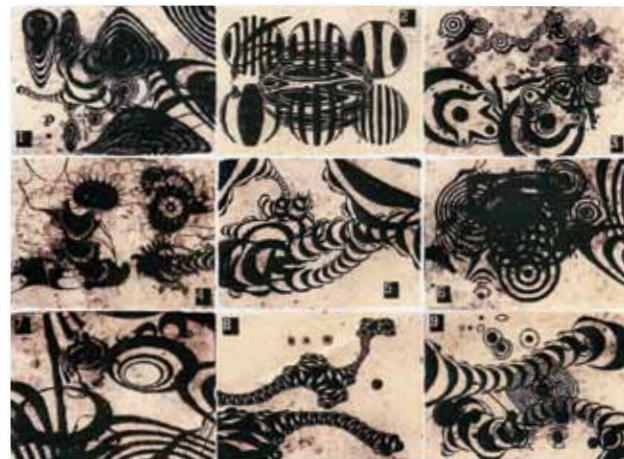
Terry Winters Tokyo Notes , 2004 Art Lithographs LOCATION: Bangkok Meeting Room and Residence Lobby