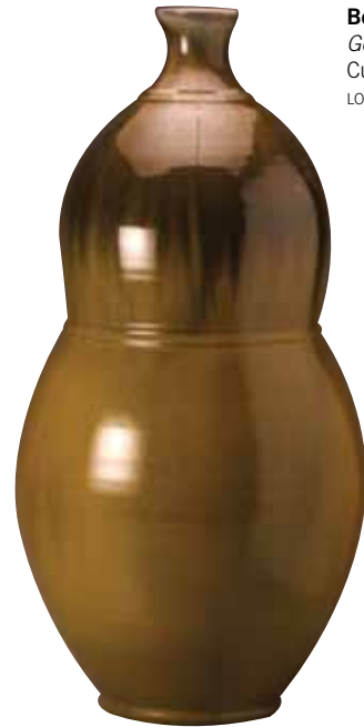
Ben Owen Gourd Custom Glazed Ceramic Pottery LOCATION: Lobby Lounge