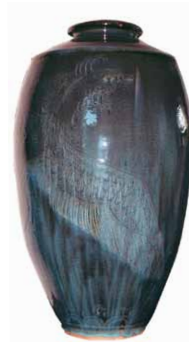
Miranda Thomas Phoenix Image, Original Ceramic Stoneware Sculpture LOCATION: Main Lobby Center Table