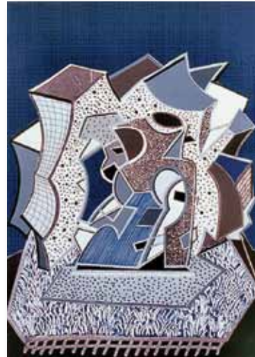
David Hockney The Deux Hand Colored Lithograph LOCATION: Reception Main Lobby