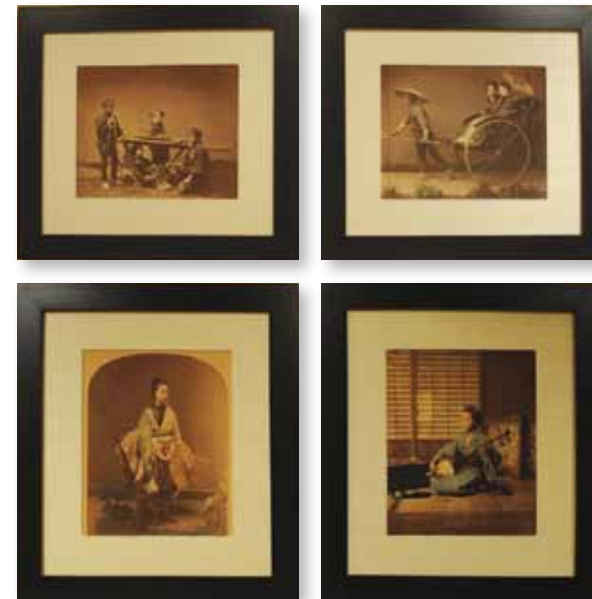
From the archives of the Boston Public Library Copies of sketches and prints of Asian life LOCATION: Throughout public and meeting spaces