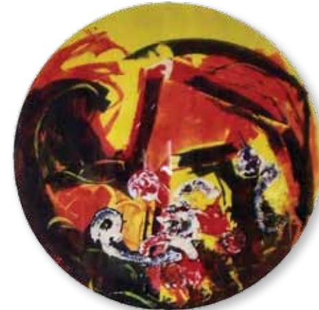
Judith A. Brust Beginnings No. 2 Original Painting on Panel LOCATION: Residence Entrance