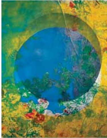
Judith A. Brust Mind's Eye No. 1 Original Monotype, Layered Painting on Canvas LOCATION: Arcade Lobby