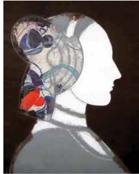
Manolo Valdes Valdes Perfill V Original Etching with Color Silkscreen LOCATION: Arcade lobby