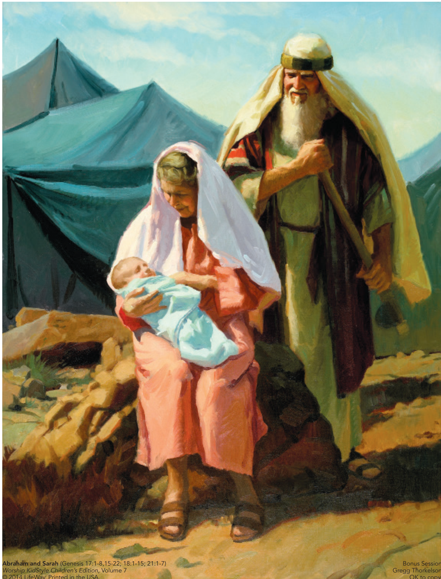
Abraham and Sarah (Genesis 17:1-8, 15-22; 18:1-15; 21:1-7) Worship KidStyle Children's Edition, Volume 7 Printed in the USA.