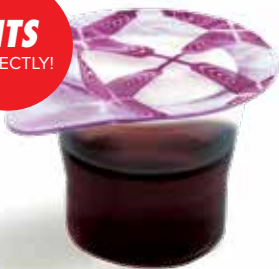
Designed to fit perfectly in Communion trays