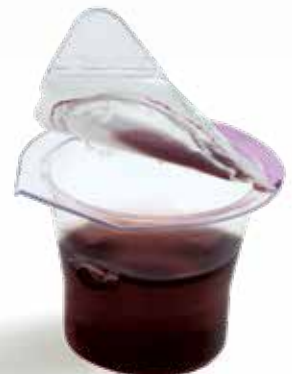
2 Peel back the second seal to drink the juice