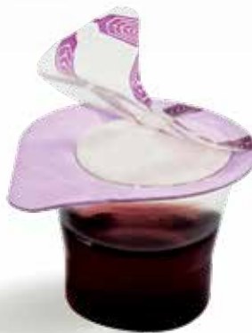
1 Peel back the air-tight seal to eat the unleavened wafer