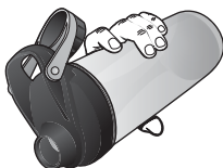
Ready to drink