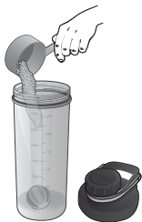
Pour in the powder

To use, insert your ingredients into the bottle with the shaker ball and shake according to drink manufacturer instructions. Make sure the lid is screwed on tightly before shaking.