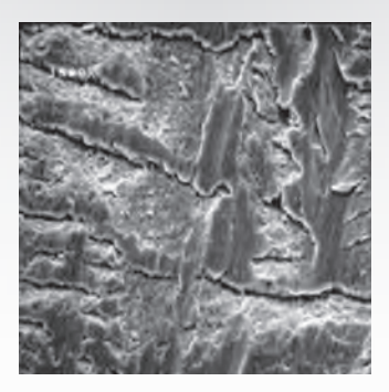
The bearing is scuffed after using a leading synthetic motor oil.