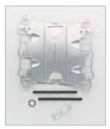
NAPA Gaskets Intake Valley Pan Set