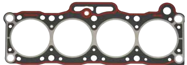
PermaTorque featuring Printoseal® Head Gasket