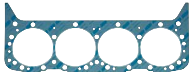
PermaTorque featuring Blue Stripe® Head Gasket