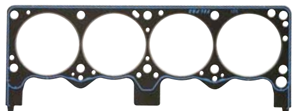
PermaTorqueSD Head Gasket