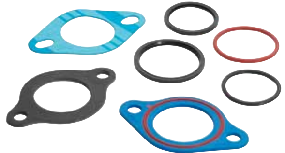
Water Outlet and Thermostat Gaskets

Water pump gaskets should be replaced when the water pump is being serviced. These gaskets are included in many Timing Cover Sets (TCS), but are also available separately. They are typically made of proprietary Blue Stripe® high-density, high-quality paper material. Their density balances good internal sealability, wick resistance, and conformability. Water pump gaskets are listed separately in the Master catalogs.